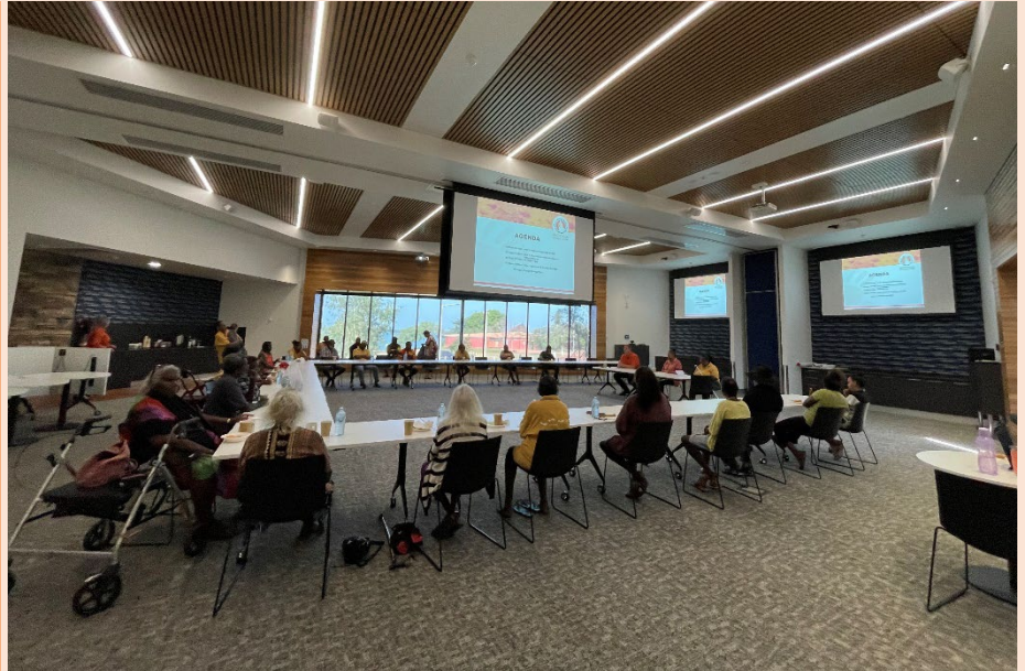
Above: East Weipa Clans Information session at the Achimbun Administration Building.

It has been a busy Q3 this year for our staff and the Traditional Owners. On the 3 rd of June the Traditional Owners of the East Weipa Mine Closure Sub-Committee decided to conduct an East Weipa Mine Clans Information Session at the Achimbun Administration Building for their families. This session provided the Alngith, Anathangayth, Peppan & Wathayn families with an update on the progress of the East Weipa Mine closure works. Following this session, another was held in Cairns on the 8 th of July for the families that were unable to attend the Weipa session. Feedback from the families was positive and very well received for both sessions held.