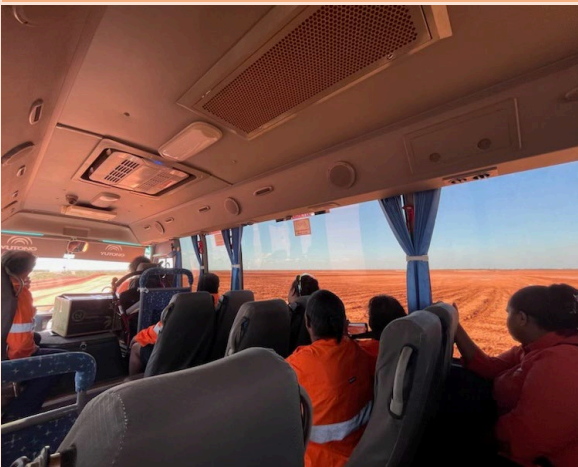
Above: We visited the Lanji Tailings Storage Facility where discussion was held on possible post mine land use options.

On the 19 th July, members of the Andoom Mine Closure Sub-Committee and some of their family members were taken on a tour of the Andoom mine site hosted by Rio Tinto Weipa. Traditional Owners were taken to different areas across the site where the team at Rio Tinto spoke about where they were up to in relation to closure and what opportunities may arise for the Traditional Owners post-closure. The group had a wonderful lunch by Bouchat Swamp, where a lot of them have never been. It was great to see Members and their families excited about closure and what it could mean for themselves, their families, and future generations to come. The WCCT want to thank the team at Rio Tinto for making this tour happen and also wants to thank our Members and their families who attended.