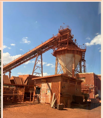
Above: The beneficiation plant which will be decommissioned if the Traditional Owners do not wish to use post closure.