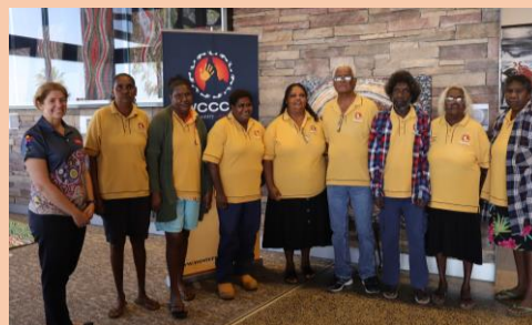
Representatives of the East Weipa mine closure subcommittee.

The MOU was jointly developed over a period of seven months by Traditional Owners and Rio Tinto and lays a path regarding the eventual return of their lands after mining at East Weipa stops. It includes co-designed consultation processes such as on-country camps, community-wide meetings and workshops around post-mining cultural heritage protection, rehabilitation, access to lands and economic development.