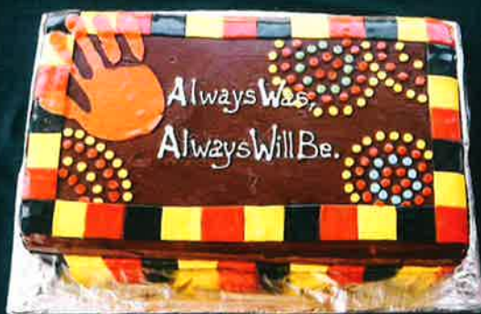
Thanks to the amazing team at Sodexo for creating this cake for our NAIDOC morning tea!