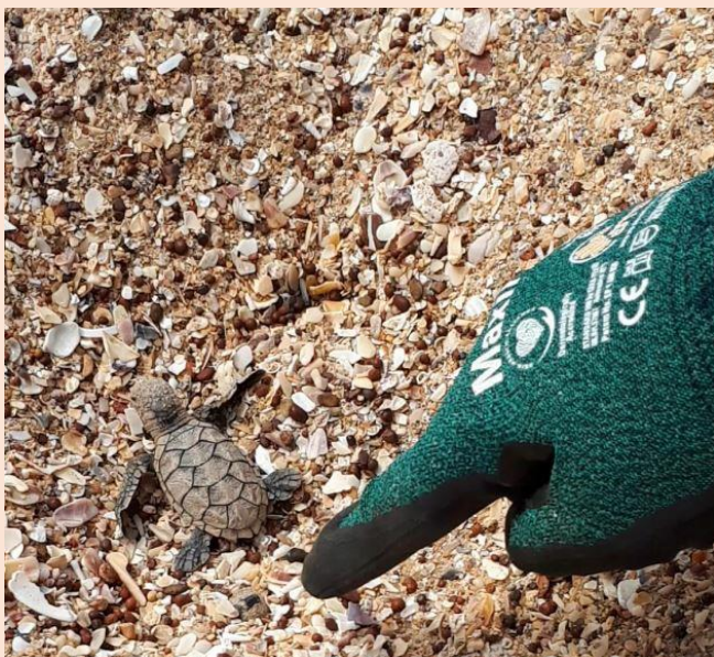
LSMP member identifies a baby turtle hatchling