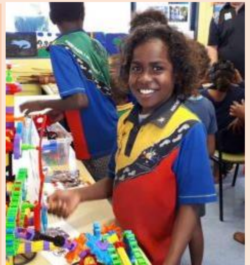
All smiles during a STEM Session at the Injinoo Junior Campus