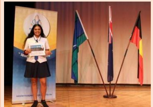
The first LAP RT University Scholarship recipient!

We are also in the midst of implementing a new Employment and Training Three Year Strategy to ensure all our LAP's have the best opportunities present within the community and the workforce as well as being able to utilize all our community has to give to better their education, home and work life.