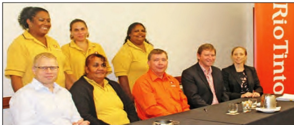
The Signing of the Achimburn Land Deal Agreement

To empower our Indigenous Directors and Members of the WCCT and the WCCCA by providing education, experience and knowledge to improve ability and performance in carrying out their corporate responsibilities whilst remaining true to their cultural identities.